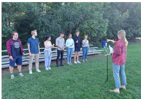
Image 1: straight line choir arrangement. Note this arrangement is typically easiest when you are just learning to lead a choir.

Bell choir players should be arranged from low C on the left to high C on the right (i.e. when you, the conductor are facing the choir, low C should be on the left of your view). You can arrange players in a straight line or a semi-circle formation: