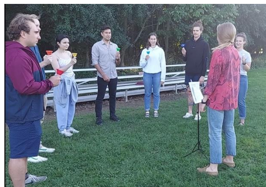
Image 2: semi-circle choir arrangement. Once you are comfortable in the leadership role, we suggest you give this formation a try!