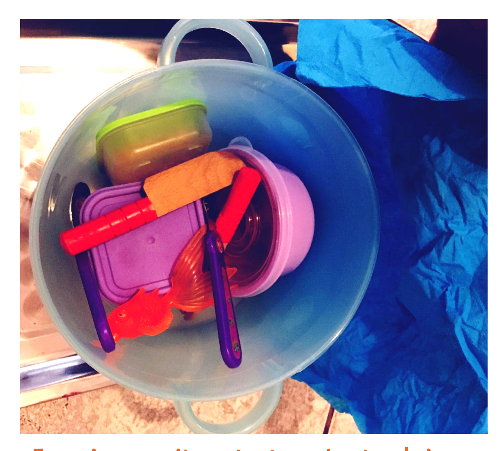
Try using your items to play a beat and sing a song! Try singing the Nanny 'n Me song or your octopus song. Your Little one may even be able