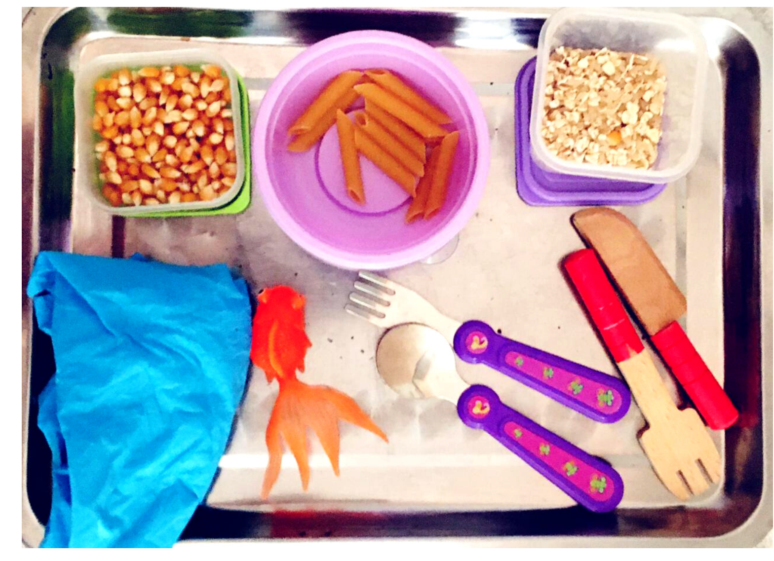
Remember to talk to your Little one and they explore! Say things Like "Wow, that makes a Loud noise" or "SHHH can you hear the soft souds"

Paint or wrapping paper to decorate treasure box (optional)