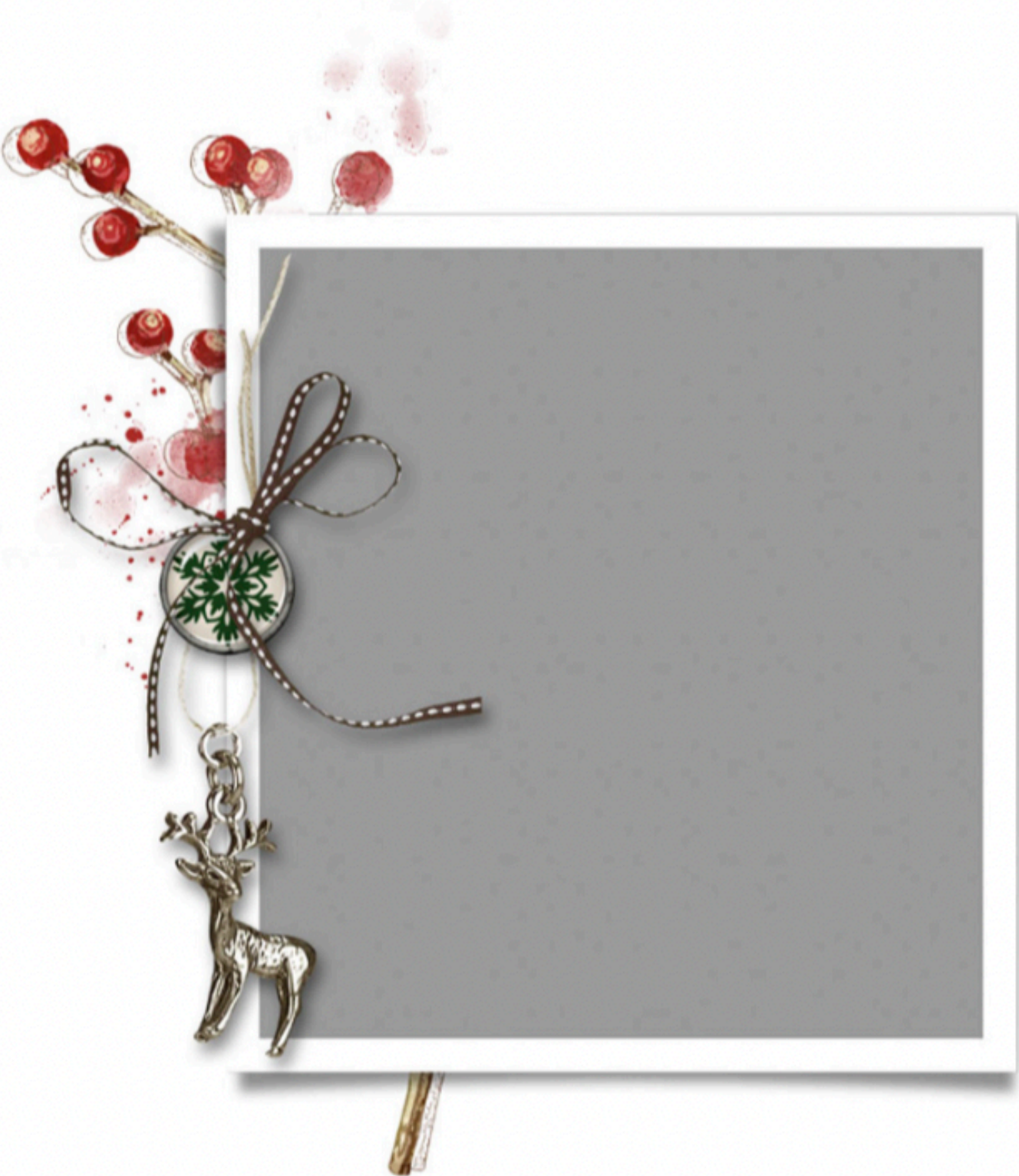
Cluster: Jen White, Kit: Holly Jolly by Tiramisu Designs