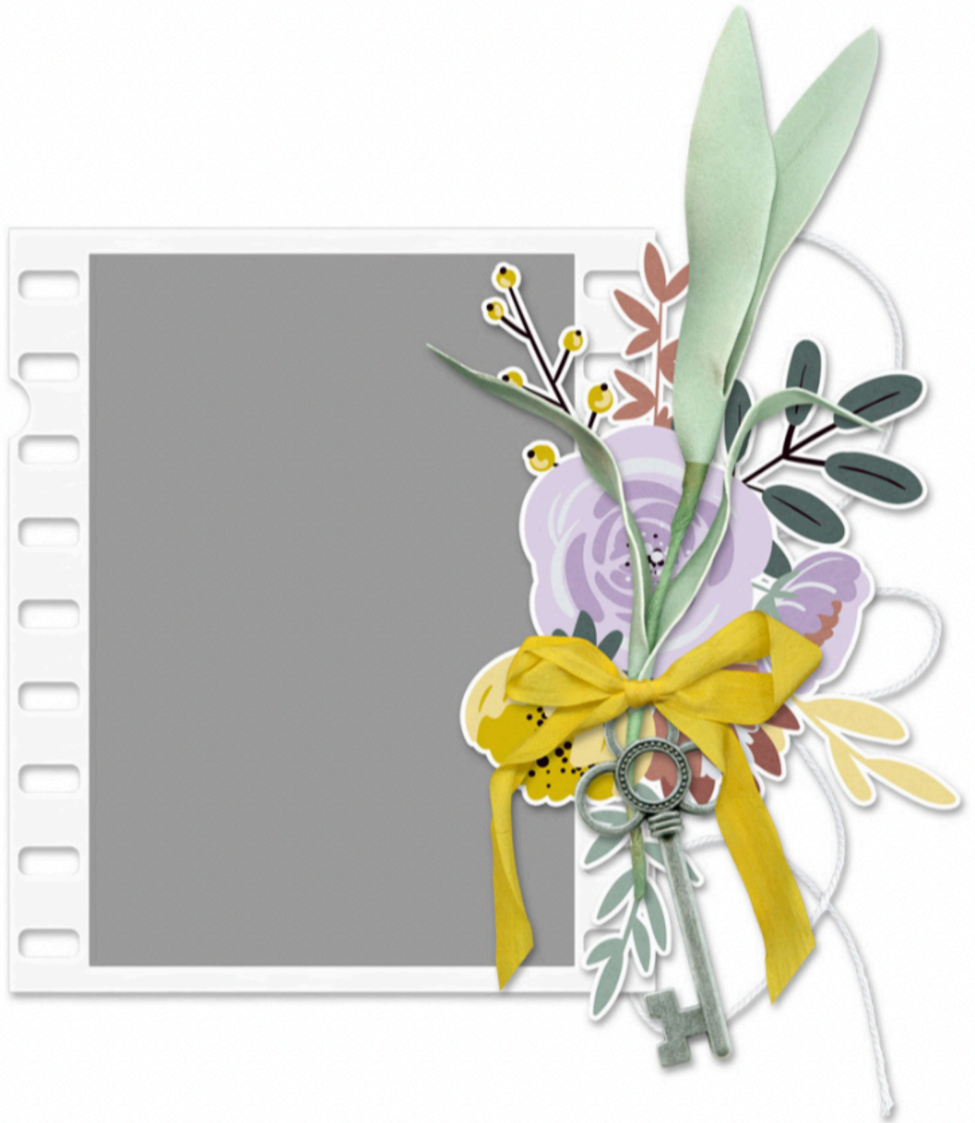
Cluster: Jen White, Kit: Unforgettable by KimB Designs