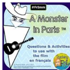
Unit for movie Un Monstre à Paris