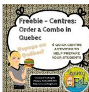
4 French Centres: Ordering a Fast Food Combo