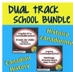
Bilingual Confederation Video Project Package