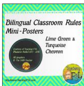
Bilingual Classroom Rules Posters

Here are some other FREE items I currently have available for download for your French class.