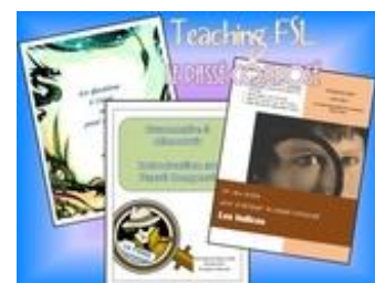
Passé Composé Bundle

© 2017 Teaching FSL Created with permission of Educorock.