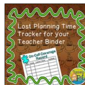
Form to Track Lost Planning Time Periods