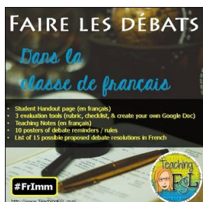
Debate Package for French Class with Linked Source Articles