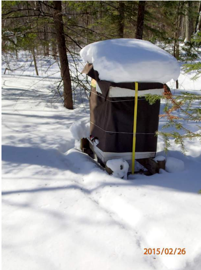
Figure 4. Beehive packed for winter. This hive is protected from direct wind by a tree barrier. It has been wrapped with tar (roofing) paper, an upper entrance was provided at the rim of the inner cover under the insulated telescoping cover, and it is strapped to the hive stand to help prevent accidental toppling due to wind, animals, or vandalism.

Both extrinsic and intrinsic factors will impact the ability of a colony to survive the winter. The main extrinsic factor affecting survival is weather . Winters vary considerably...they may be wet and cold, dry and cold, wet and mild, dry and mild, windy, icy, etc. We cannot control or even reliably predict the weather, but we can optimize colony housing conditions and food stores. It is important to choose a suitable hive location, ensure that hive furniture is in good condition and properly ventilated, and leave adequate honey stores in the hive. All these things can be readily optimized by the beekeeper and must be done while temperatures during the day are still above 50°F(10°C) because opening colonies in the cold is at best stressful, and at worst, lethal.