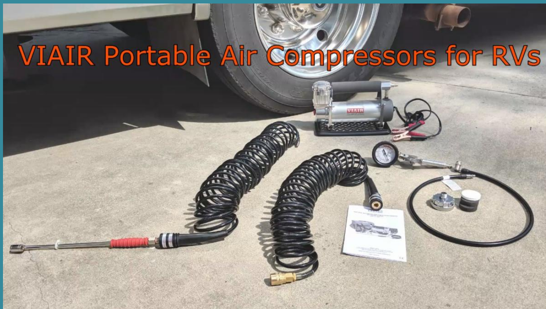
VIAIR Portable Air Compressors for RVs

I think most RV owners understand the importance of maintaining proper tire inflation pressure. The problem is, if you wait until you're on the road to check tire pressure the tires are too hot for correct evaluation. Checking the inflation pressure when you stop to refuel doesn't make sense either; you will get higher pressure readings and if you let air out the tires they are under-inflated when they are cold again.