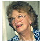
Virginia Satir (an eminent Family Therapist)