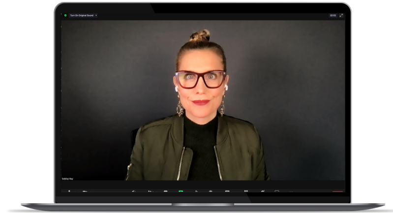
APPLE AIR PODS PRO

Every headset has a different sound quality, pros, and cons. It's always good to have two different kinds of microphones and a backup, especially if you are using rechargeable and wireless options.