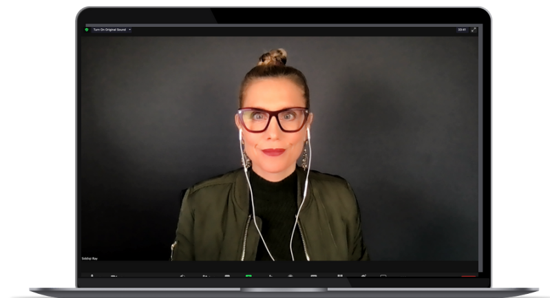
APPLE EAR PODS