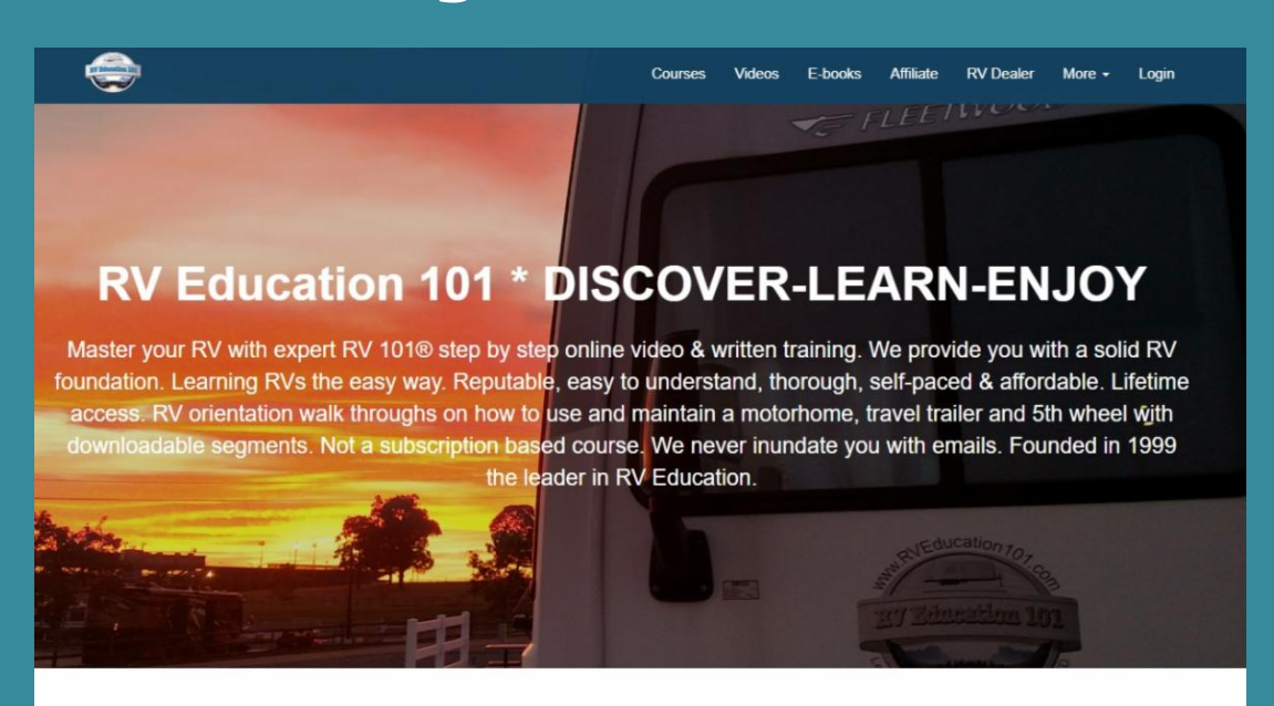
Featured RV Education 101 Courses