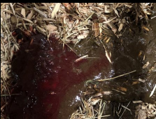
COCCIDIOSIS 21 DAYS - 2 YEARS PROTOZOA