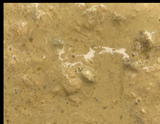
CRYPTO 5-35 DAYS PROTOZOA