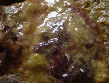
CORONAVIRUS 5-30 DAYS VIRUS