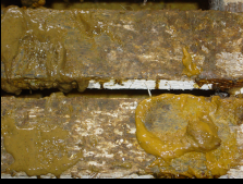
E.COLI < 5 DAYS BACTERIA