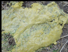
ROTAVIRUS 1-2 WEEKS VIRUS