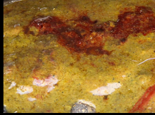
SALMONELLA 5-14 DAYS BACTERIA