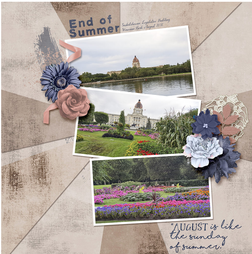
Page & Photos: Michelle Belisle Kit: End of Summer by Kaklei Designs Font: Lelucky