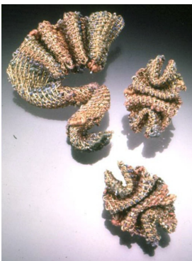
1" gold warp twisted & folded