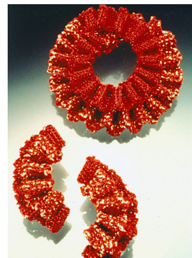
3/8" red warp pleated and twisted