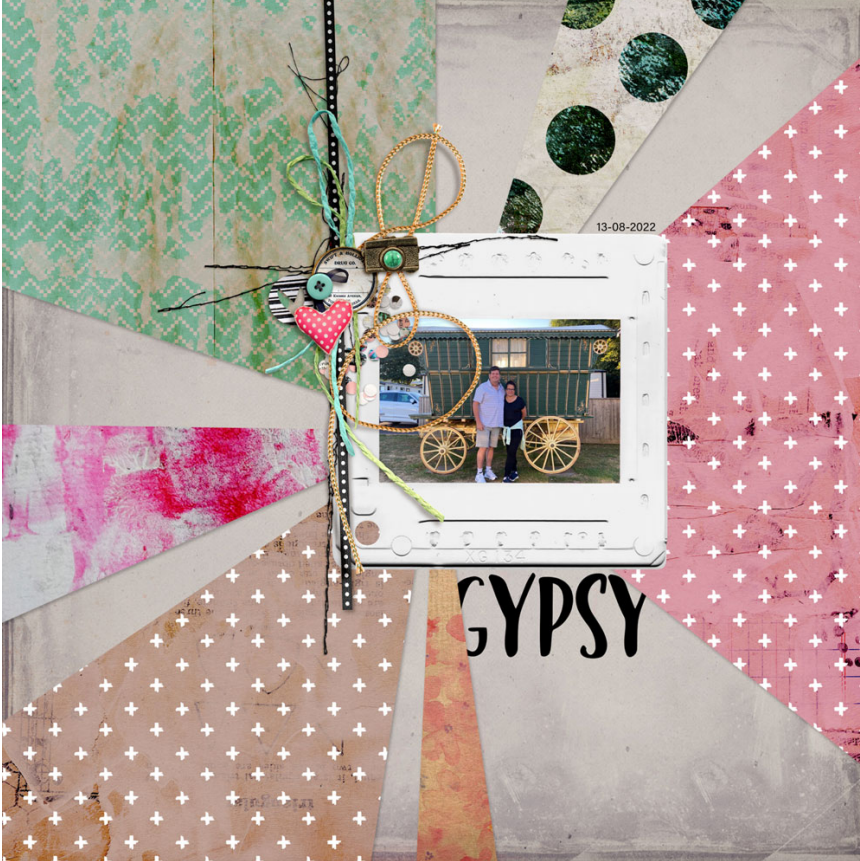
Page: Gypsy by Adelle Fourie Kit: Embrace the Moment by Studio Basic & Simple Pleasure Designs Fonts: Rosthila Sans, Acumin Variable Concept