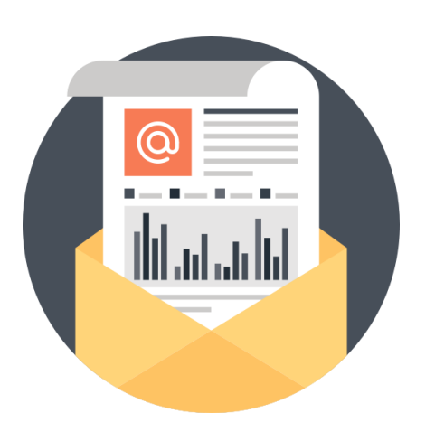
Three million messages sent.