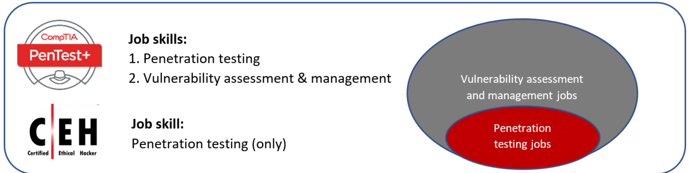
Figure 3: More job roles = more employability with PenTest+