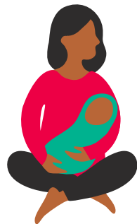
les mamans /lay mah-mon/