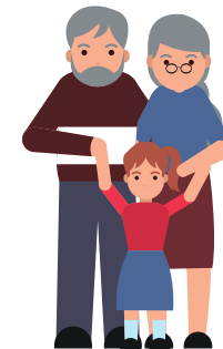
les grand-parents /lay gron-pah-ron/