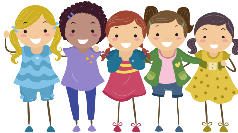
les filles /lay fee-yuh/