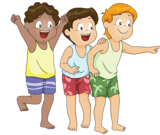
les garçons /lay garr-son/