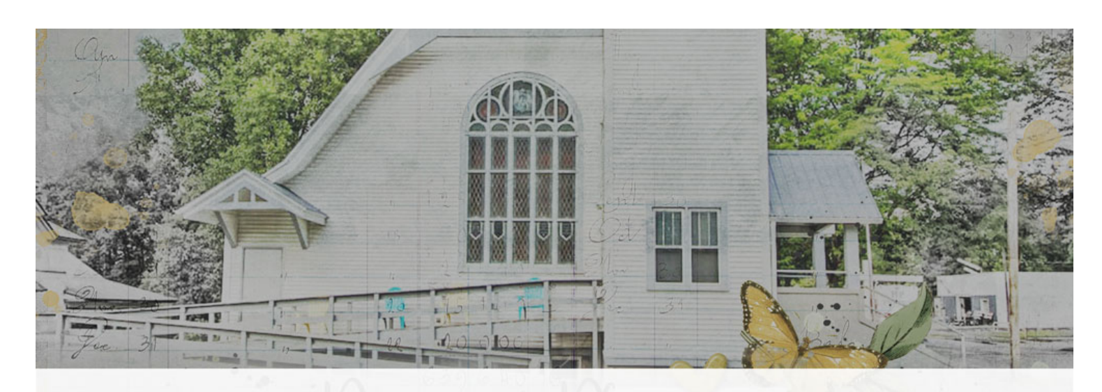
Uigital Scrapper Premier 2023, Volume 7