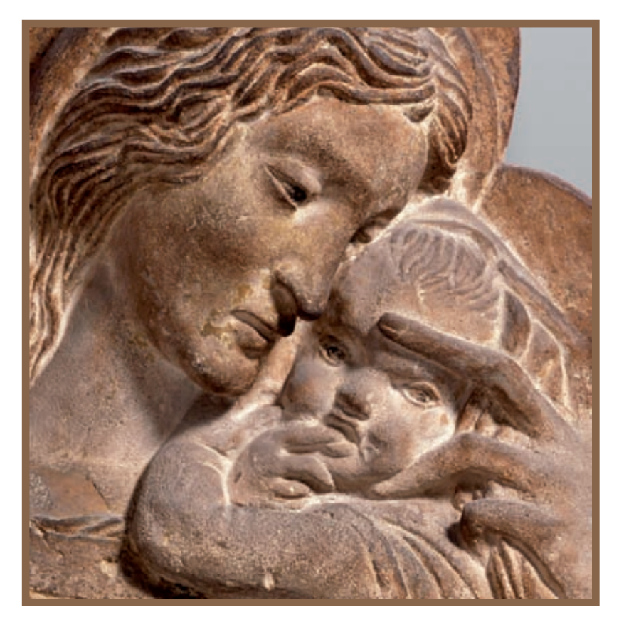
THE REAL SPIRITUALITY

There is a prostitute who doesn't have food in her stomach and needs to protect her baby. The mother is holding her crying baby. Even she is hungry. She has to make milk for the baby to drink. Then a guy comes with $100. She puts the baby under the tree and she gives satisfaction to that man for $100. That is the reality. That is the spirituality.