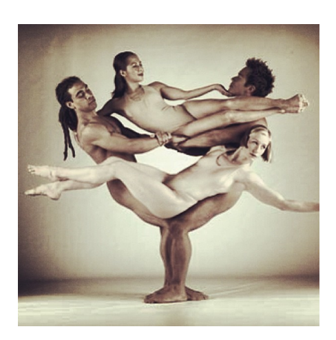
Start by doing what's necessary; then do what's possible; and suddenly you are doing the impossible." - St. Francis of Assisi