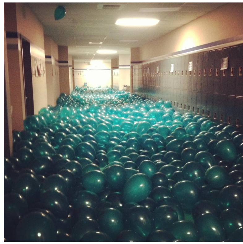
"True learning is based on discovery guided by mentoring rather than the transmission of knowledge." - John Dewey

Then the professors mixed up all the balloons.