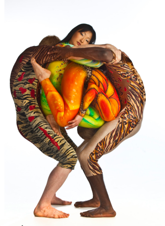
"When you dance, your purpose is not to get to a certain place on the floor. It's to enjoy each step along the way." - Wayne Dyer

© Udana Power - 2021 All Rights Reserved