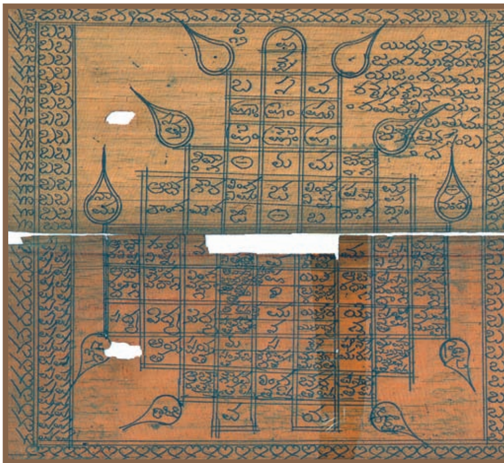
Palm leaf of Shiva and Mother Divine

The palm leaf also has a Shiva 4 lingam yantra, which is very, very, very powerful. It shows the whole birth and death, Shiva, the Param Parampara , and you. Amazing bijaksharas exist here and are unbelievably flowing in this book. I will talk more comfortably in the second volume about that.