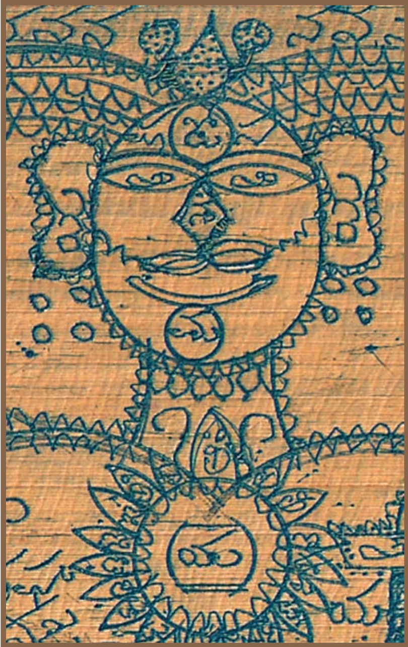
Close-up of Shakti's head and heart