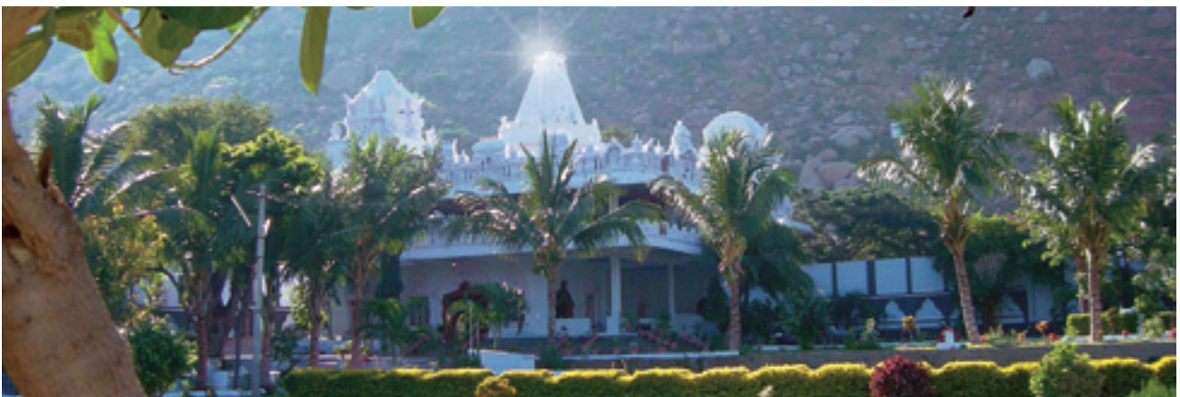
Shiva Sai Mandir, Penukonda, India

Why is it like this? A powerful soul, a holy person who meditates on the land for a certain period—who even walks on the land, or one time if he kicks that and, or one time touches that land—that land, for some hundreds, thousands of years, radiates the energy. It starts to produce the energy vibrations. It becomes a powerful place.