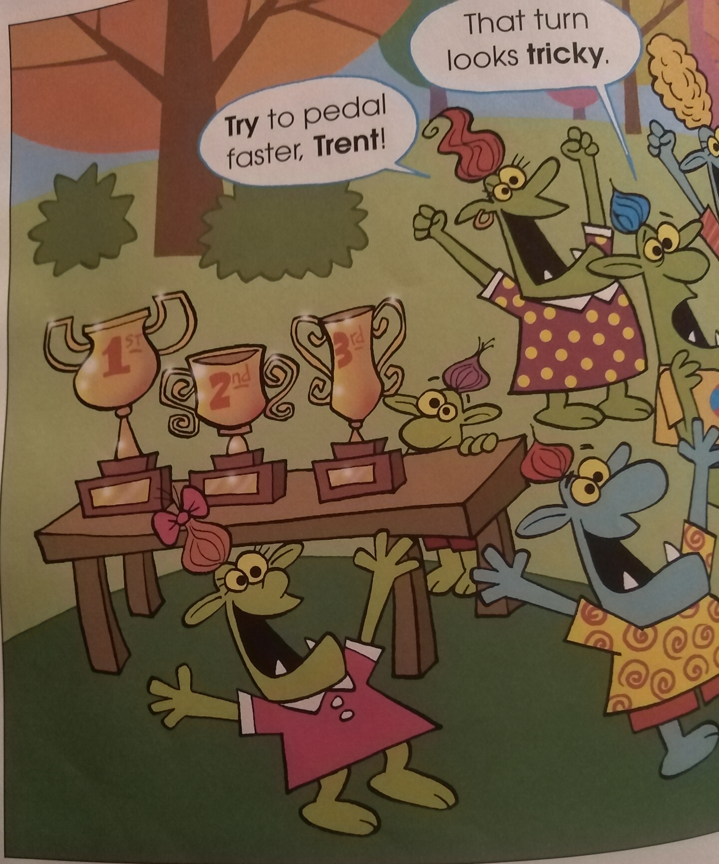
The trolls play games and try to win trophies .