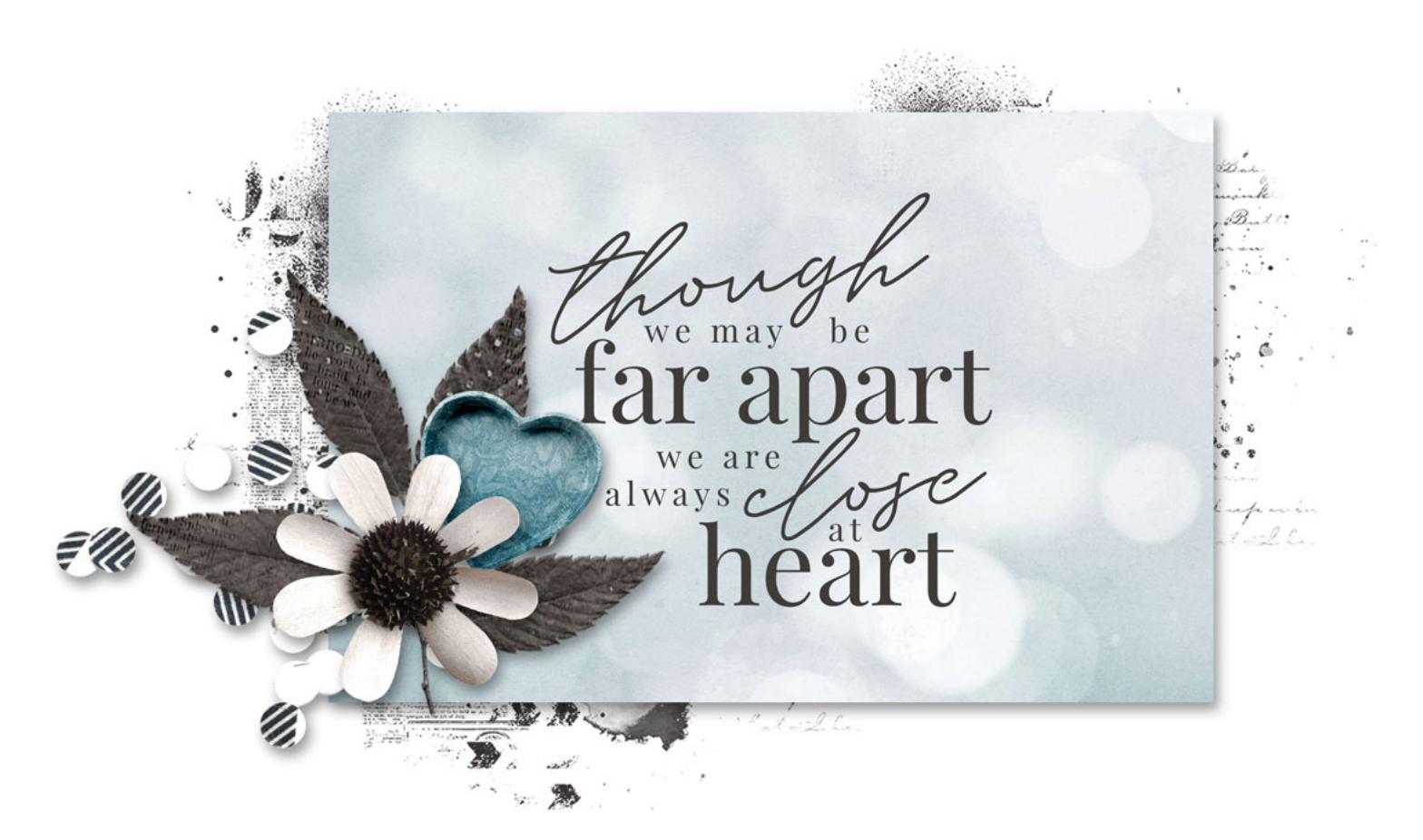
Cluster: Jen White, Kit: Kristin Cronin-Barrow