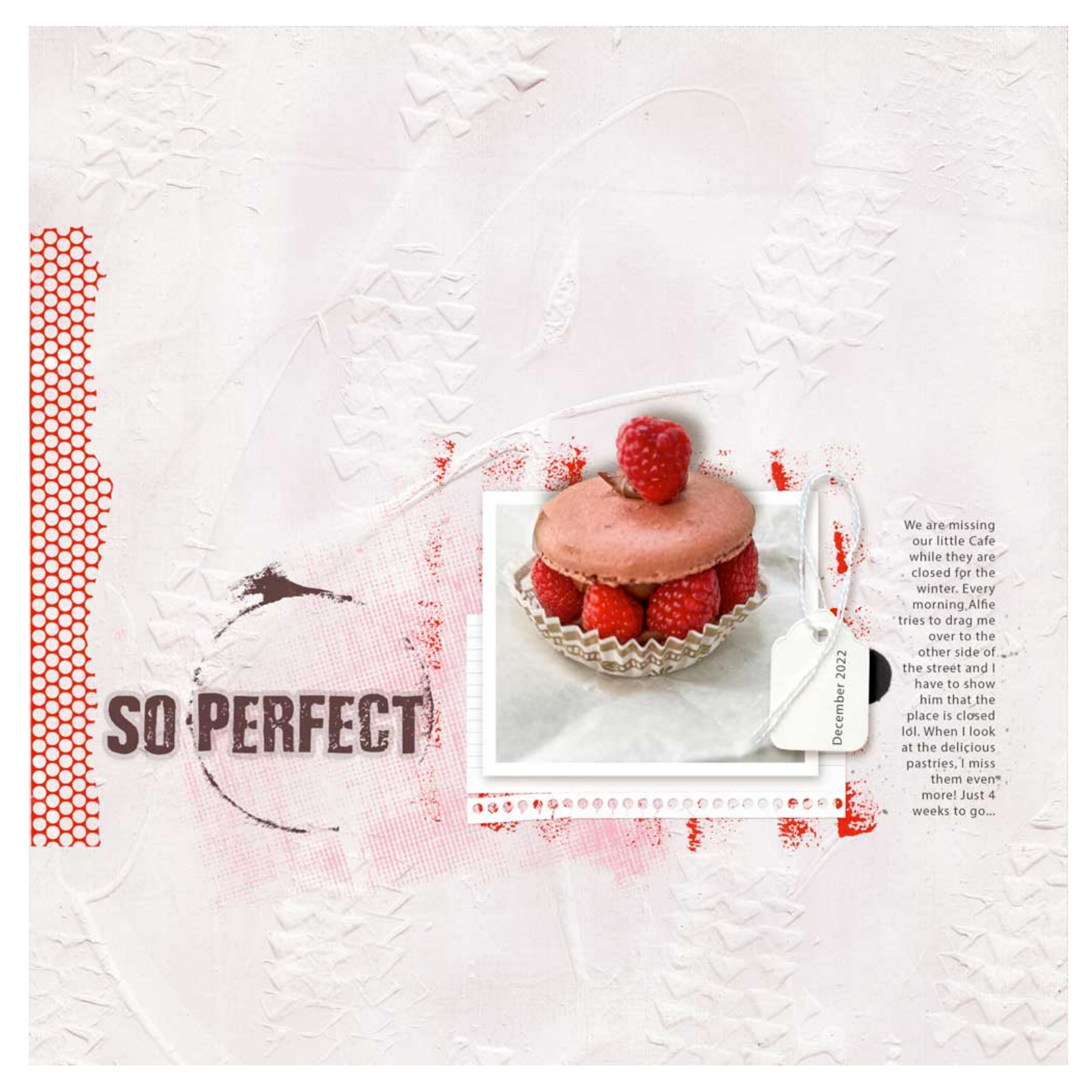
Photo & Page: Anke Turco Class: DSP23, Vol 5, Lesson 2, Out-of-Bounds Photo Kit: A Perfect Day by Vicki Robinson Font: Myriad Pro