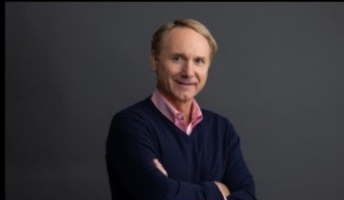
Dan Brown Teaches Writing Thrillers