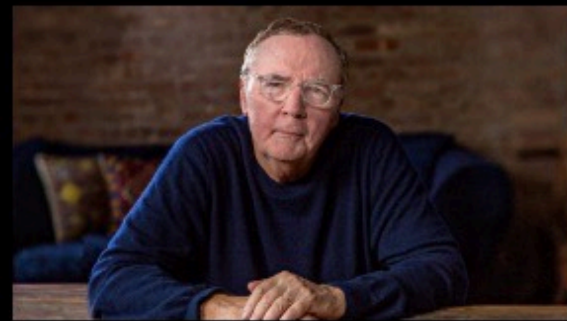
James Patterson Teaches Writing