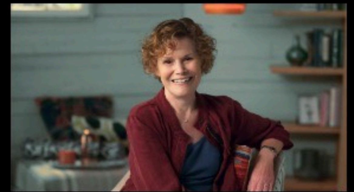
Judy Blume Teaches Writing