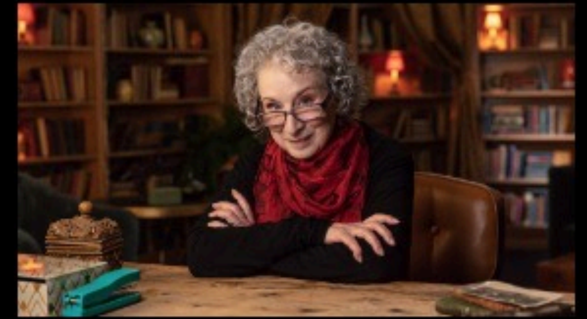
Margaret Atwood Teaches Creative Writing