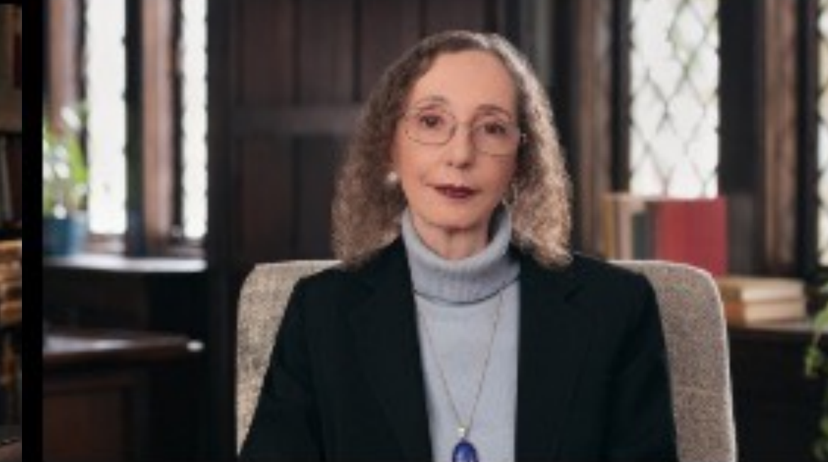
Joyce Carol Oates Teaches the Art of the Short Story