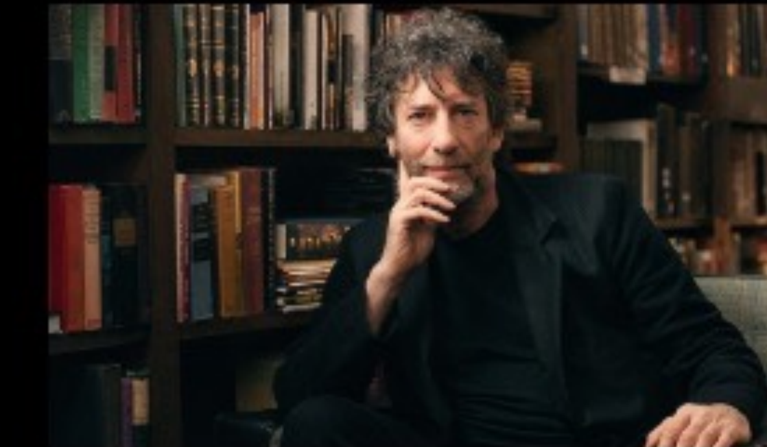
Neil Gaiman Teaches the Art of Storytelling