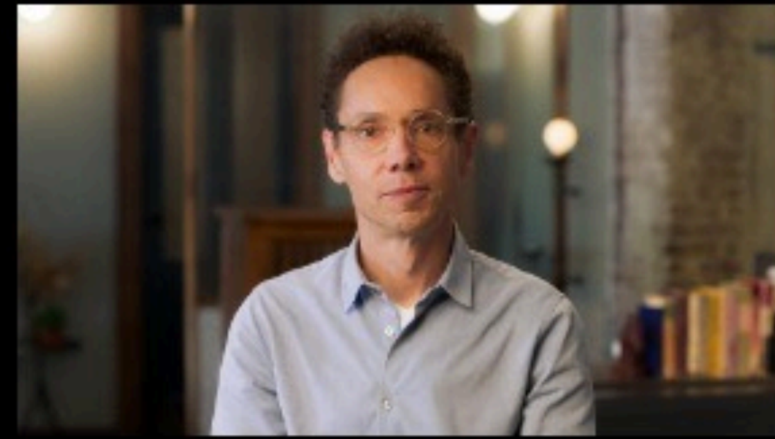
Malcolm Gladwell Teaches Writing