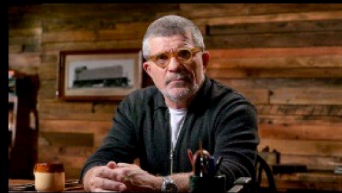
David Mamet Teaches Dramatic Writing