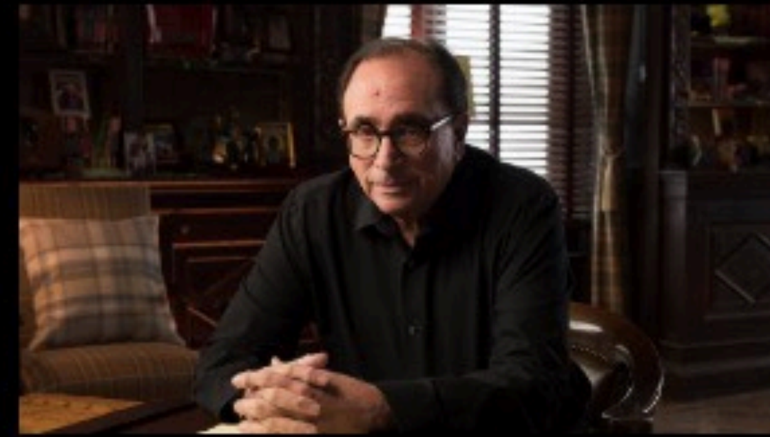
R.L. Stine Teaches Writing for Young Audiences