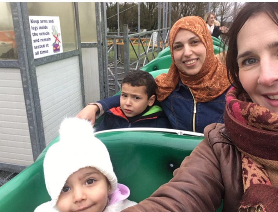
Show them around the local neighbourhood