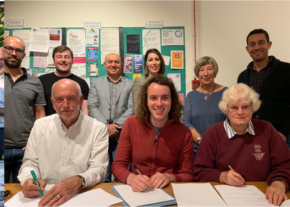
Prepare and submit applications to your local council and the Home Office