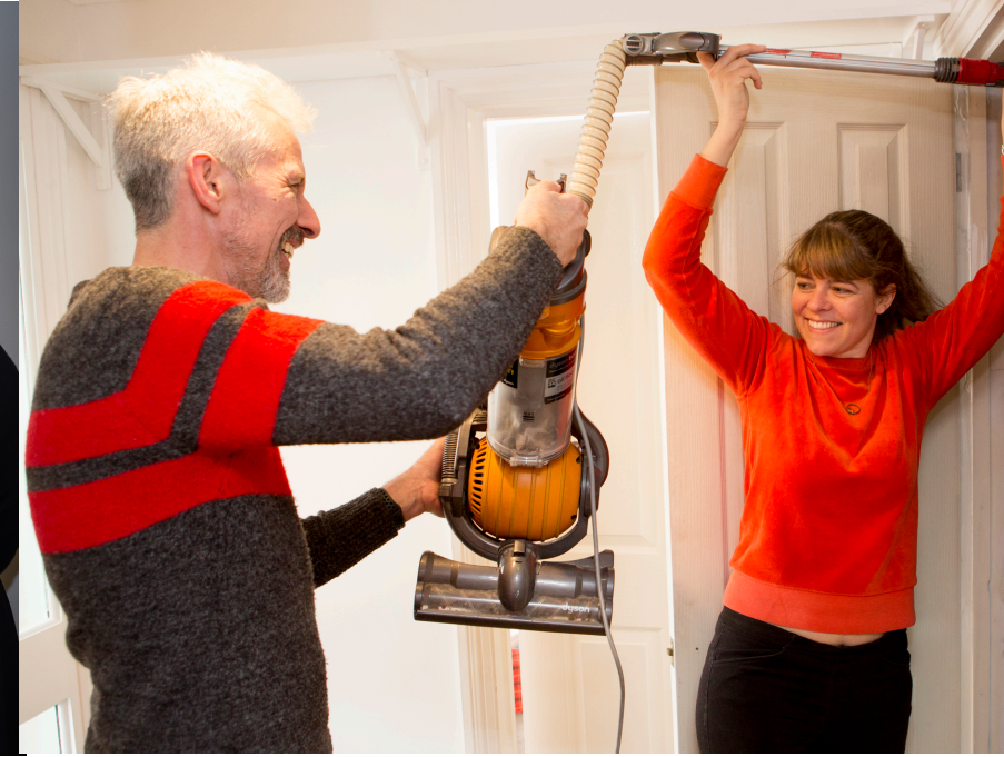
Secure a house for at least 2 years