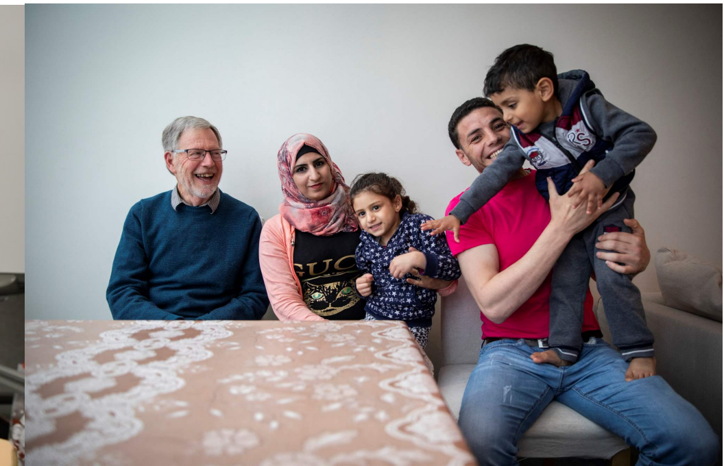
Enjoy the incredible times ahead