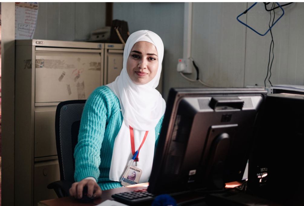
Help them sign up for benefits, doctors, dentists etc.