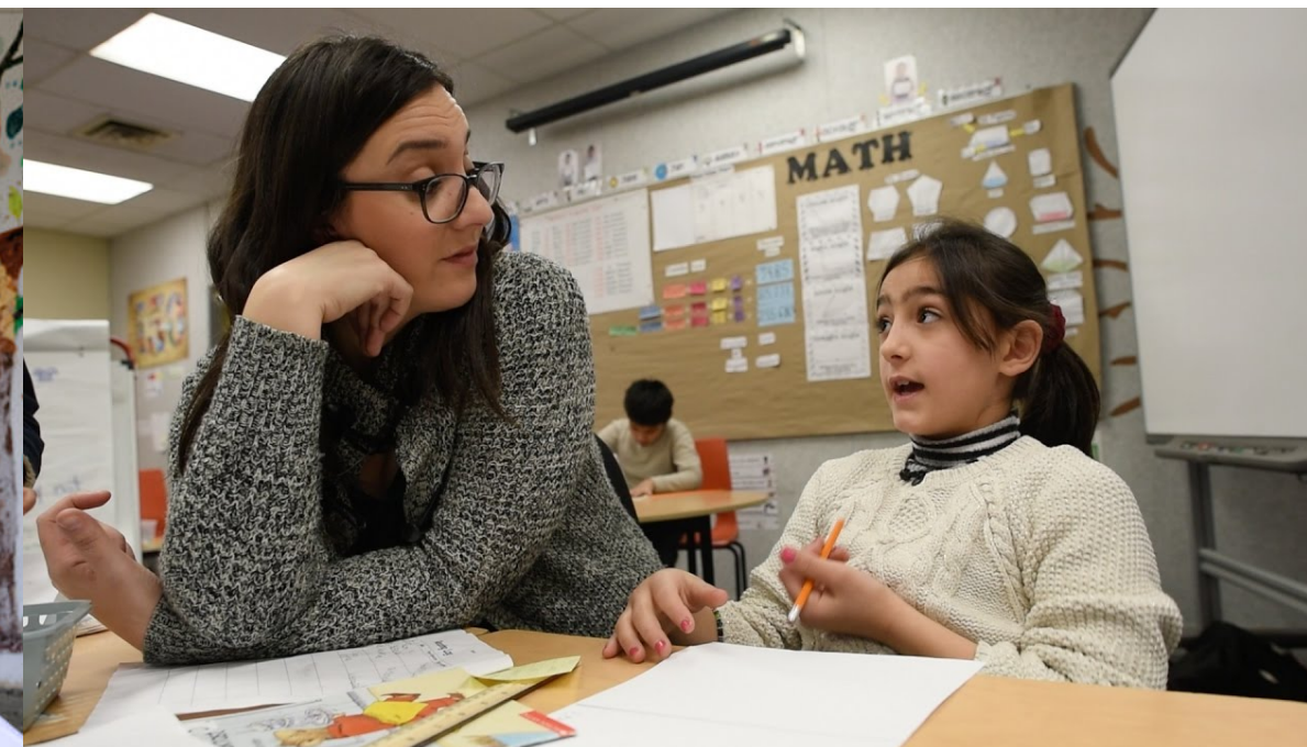
Assist with ESOL classes and general language skills