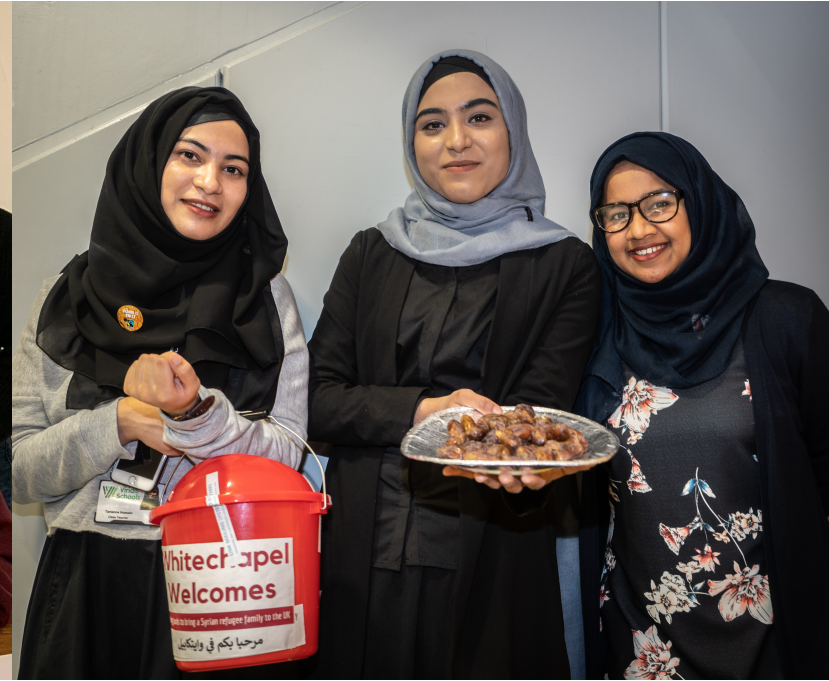
Fundraise a minimum of £9,000