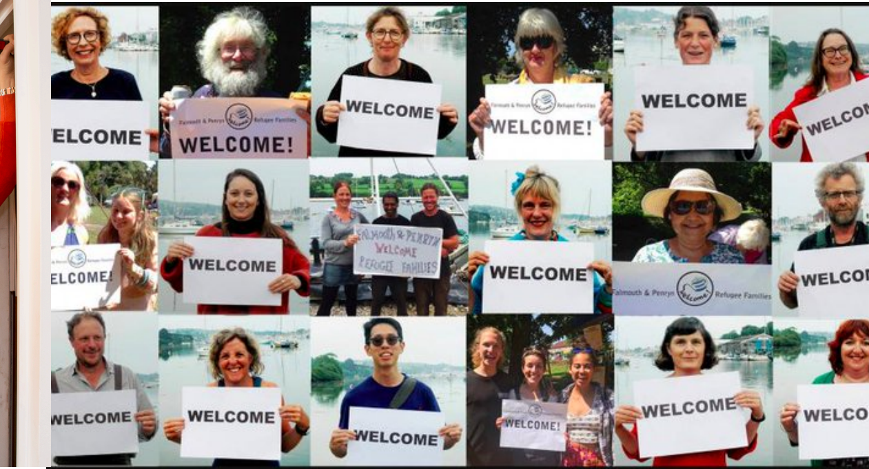
Welcome a refugee family to your neighbourhood