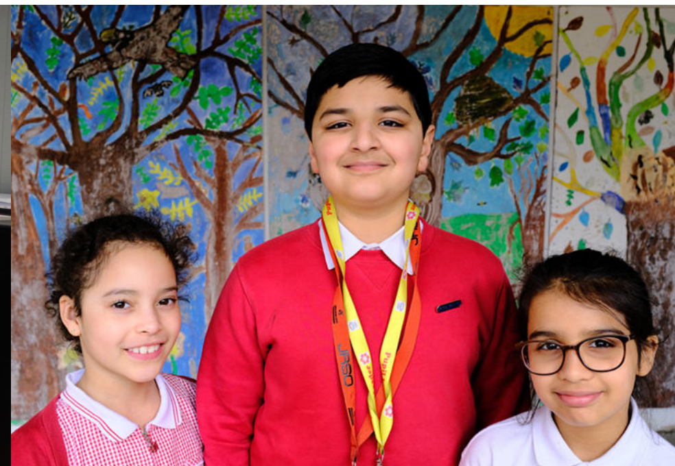
Enrol the children in a local school