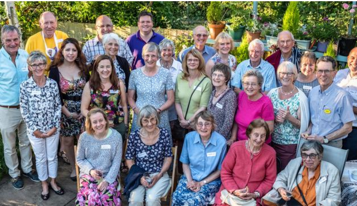
Form a core group and find volunteers to help