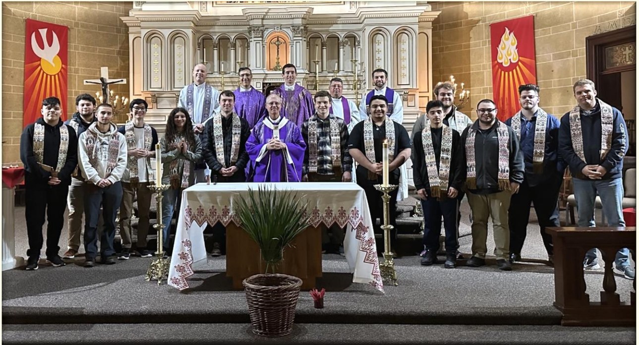
The First All-Night Vigil Group – Spring 2023