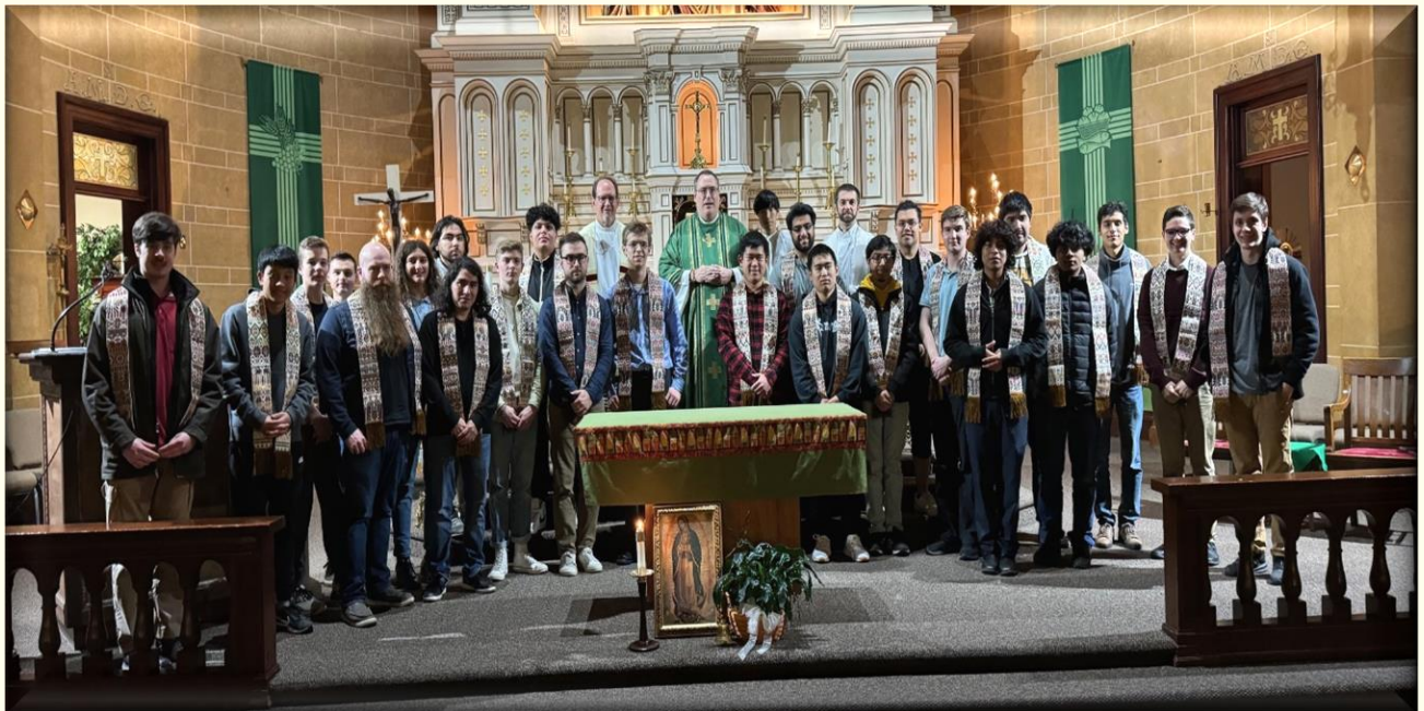
The Second All-Night Vigil Group – Fall 2023