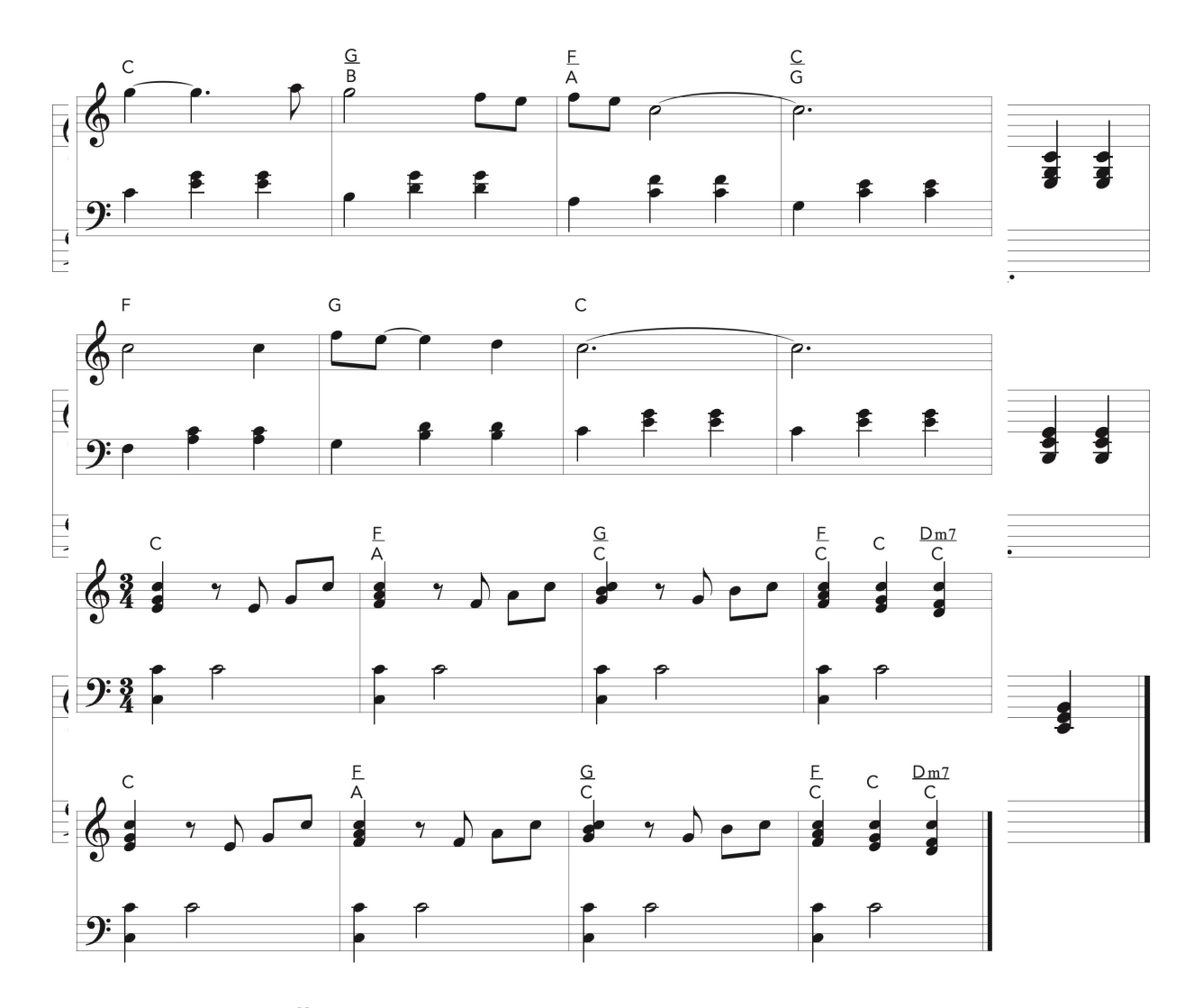
Step #4: Put it all together.

Remember that you can (and should!) customize this to fit your skill level. If the chord inversions are too challenging for you, then play them all root positiong. If you want to level it up, try altering the groove or adding some solo fills.