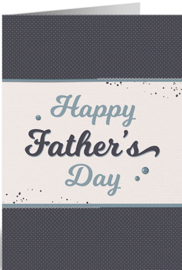
Kit: Here Again by Dawn by Design Font: Milkshake