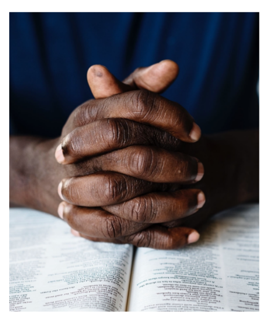
Palm & Pen School For Christian Artists

Be diligent (study) to present yourself approved to God, a worker who does not need to be ashamed, rightly dividing the word of truth. 2Ti 2:15