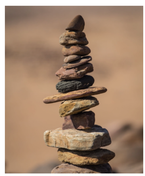
Palm & Pen School For Christian Artists

as His divine power has given to us all things that pertain to life and godliness, through the knowledge of Him who called us by glory and virtue, 2Pe 1:2-3