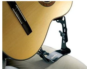
Ergoplay troster model