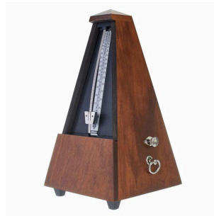
Mechanical metronome: https://amzn.to/3vue8Yy