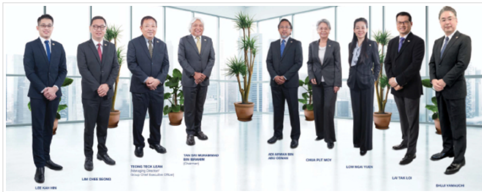
Standing From Left To Right :

No Gift Policy (/malaysia/corporate-info/no-gift-policy/)