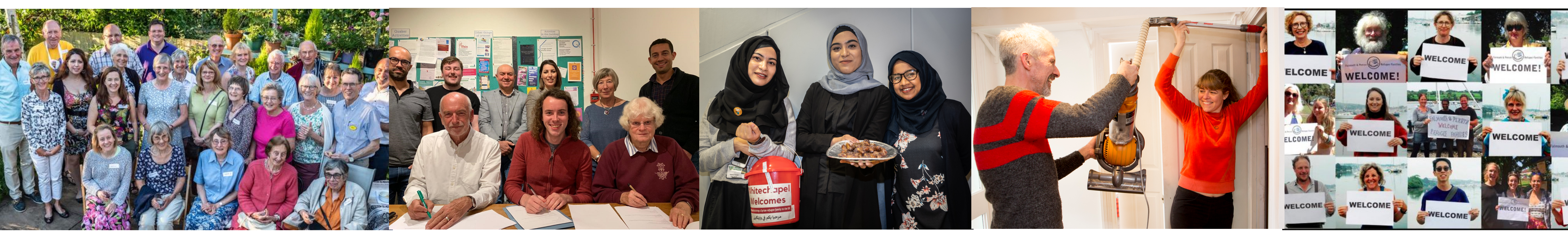
Form a core group and find volunteers to help

Prepare and submit applications to your local council and the Home Office