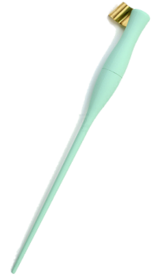
2-in-1 Holder (to try both!)