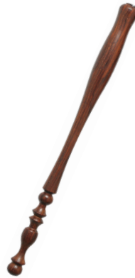
Straight Holder (recommended for left-handed)