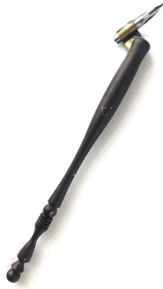
Oblique Holder (recommended for right-handed)