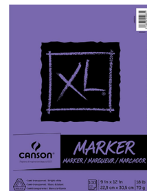
Marker Paper (for tracing)