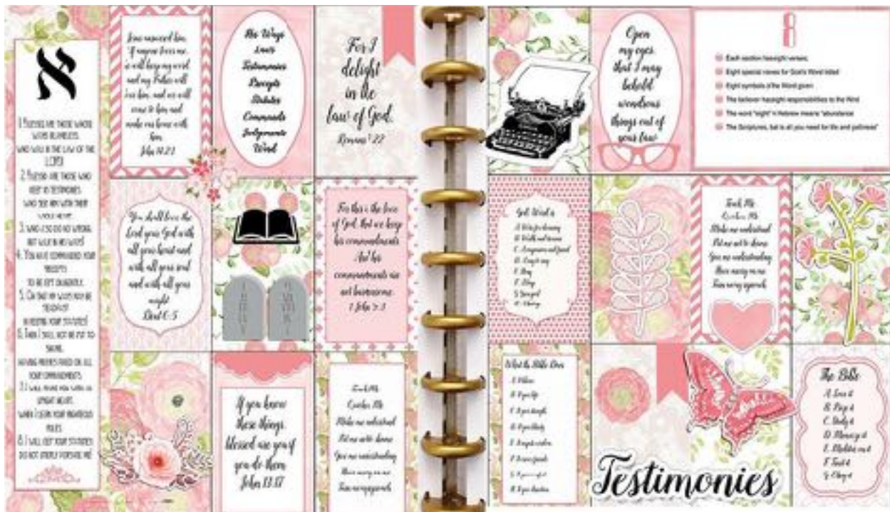
Use One or Two Quick Pages and Stickers with Notes per Lesson