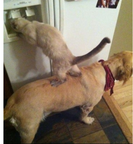
Sometimes you will need the team and sometimes the team will need you. Nobody does this alone.

Relax, daydream and sketch out your answer here: