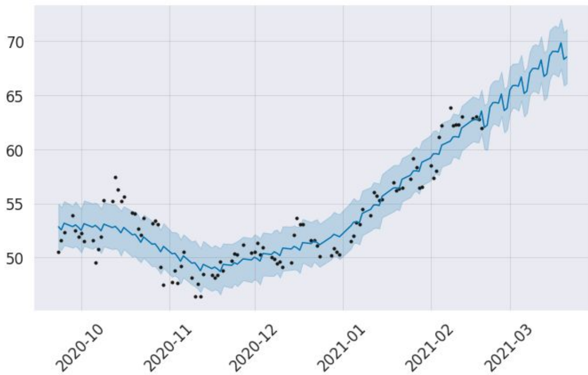
EBAY 1 Month