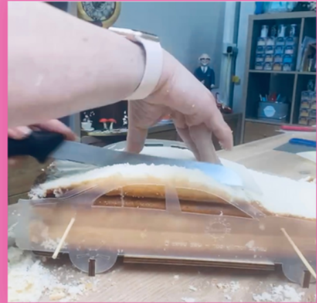
SET OF CARVING TEMPLATES

Both elements of the kit have been sized proportionately and whilst the templates are designed for a specific type of car, the cake can be adapted to make other cars that fit within that size / shape of vehicle range.