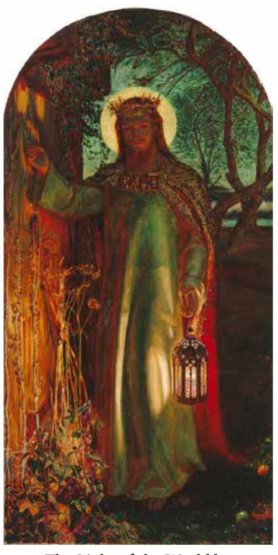
The Light of the World by William Holman Hunt

I come—longing to console you and give you strength, to lift you up and bind all your wounds. I bring you My light, to dispel your darkness and all your doubts. I come with My power, that I might carry you and all of your burdens; with My grace, to touch your heart and transform your life; and My peace I give to still your soul.