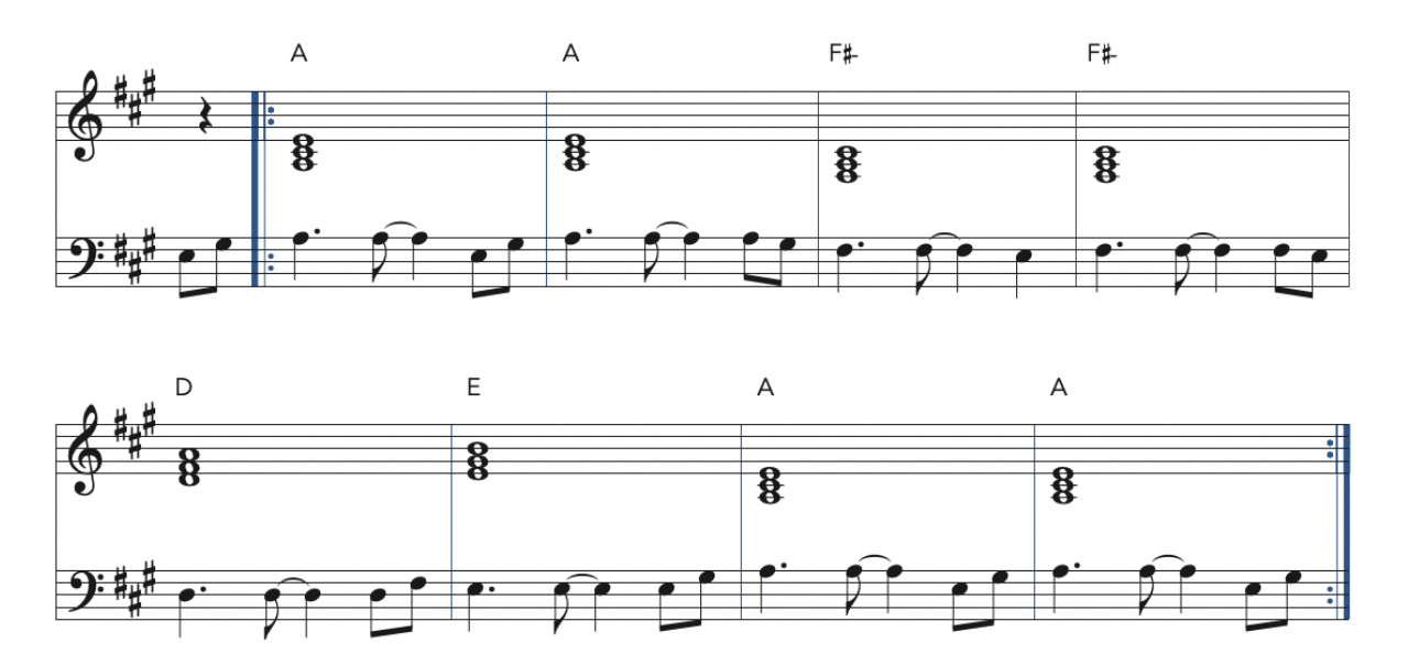
Step #4: Put it all together.

This song's hook is the iconic bass line, which makes you feel like you could just groove on forever.