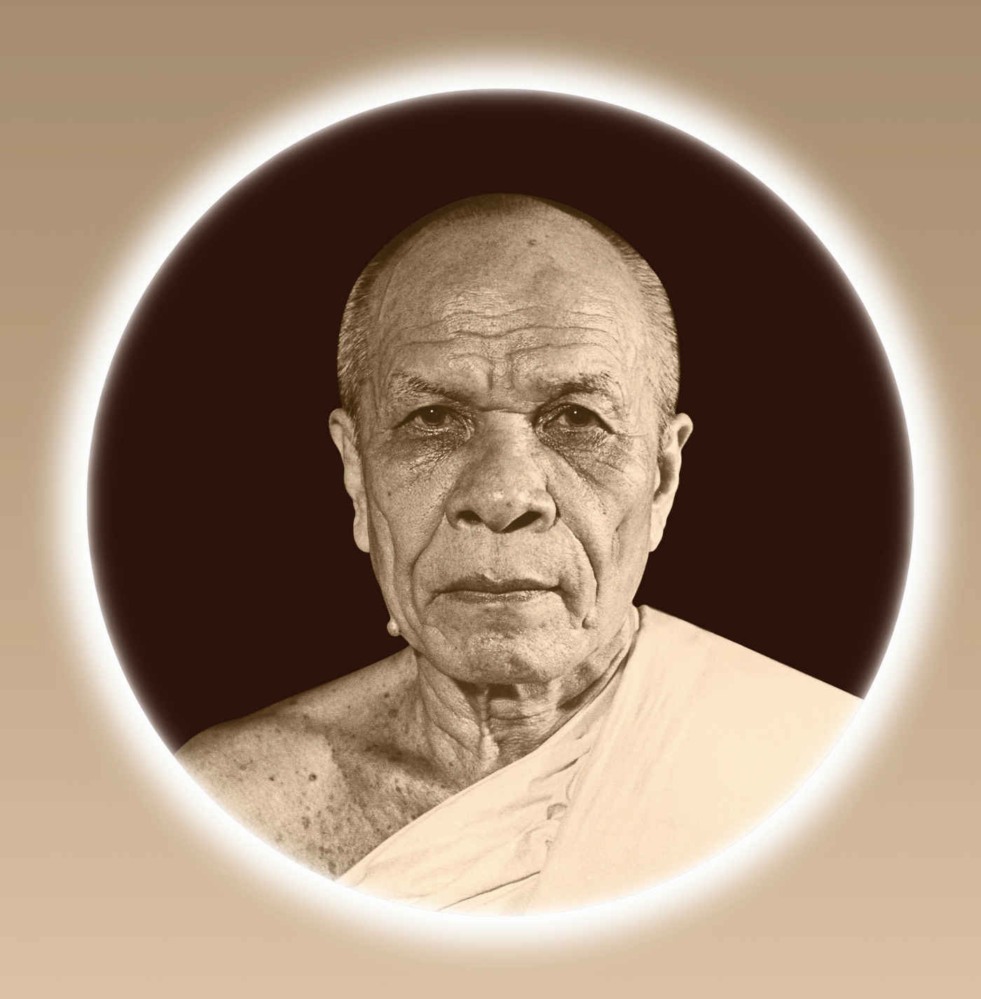
Phramonkolthepmuni (Sodh Candasaro) The Discoverer of Vijja Dhammakaya