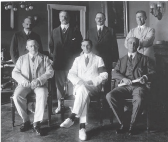
The first Federal Reserve Board, 1914

The Board of Governors of the Federal Reserve System is a federal government agency. The Board is composed of seven members, who are appointed by the President of the United States and confirmed by the U.S. Senate. The full term of a Board member is fourteen years, and the appointments are staggered so that one term expires on January 31 of each even-numbered year. After serving a full term, a Board member may not be reappointed. If a member leaves the Board before his or her term expires, however, the person appointed and confirmed to serve the remainder of the term may later be reappointed to a full term.