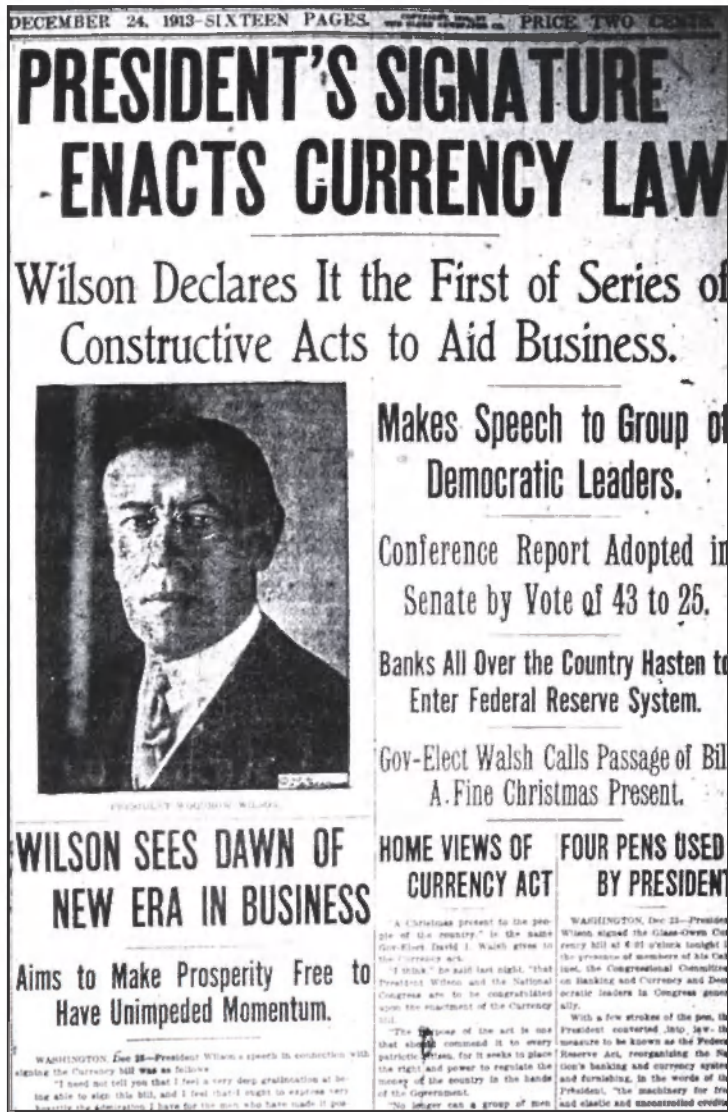
President Wilson signed the Federal Reserve Act on December 23, 1913.

Soon after the creation of the Federal Reserve, it became clear that the act had broader implications for national economic and financial policy. As time has passed, further legislation has clarified and supplemented the original purposes. Key laws affecting the Federal Reserve have been the Banking Act of 1935; the Employment Act of 1946; the Bank Holding Company Act of 1956 and the amendments of 1970; the International Banking Act of 1978; the Full Employment and Balanced Growth Act of 1978; the Depository Institutions Deregulation and Monetary Control Act of 1980; the Financial Institutions Reform, Recovery, and Enforcement Act of 1989; the Federal Deposit Insurance Corporation Improvement Act of 1991; and the Gramm-Leach-Bliley Act of 1999. Congress has also adopted legislation defining the primary objectives of national economic policy, including the Employment Act of 1946; the Federal Reserve Reform Act of 1977; and the Full Employment and Balanced Growth Act of 1978, which is sometimes called the Humphrey-Hawkins Act, after its original sponsors. These objectives include economic growth in line with the economy’s potential to expand; a high level of employment; stable prices (that is, stability in the purchasing power of the dollar); and moderate long-term interest rates.