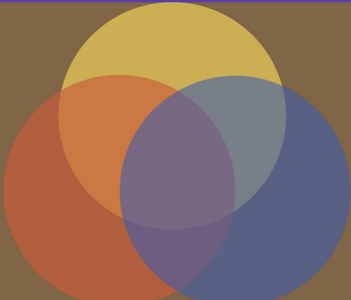
COLOR THEORY ON MEDIUM-TAN SKIN