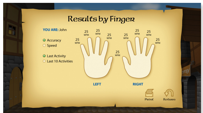
Students get instant feedback on all typing activities. Performance assessments are provided by key, finger, hand, and row.