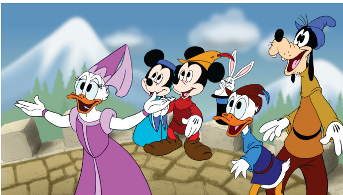
Solve the mysterious enchantment in Typelandia! Help Mickey's friends make it to the Palace for a sensational celebration at the Faire.

Disney: Mickey's Typing Adventure Web has a proven educational design that teaches students all of the letters on the keyboard as they type their way to each exciting destination in Typelandia! They are taught proper typing posture and finger placement following one of 11 Typing Courses for their age