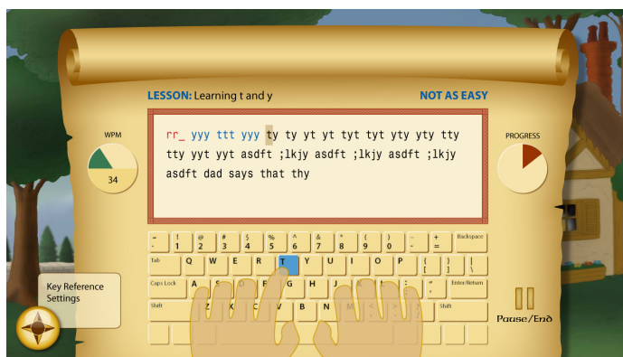
Lessons include step-by-step instruction with visual guide hands.