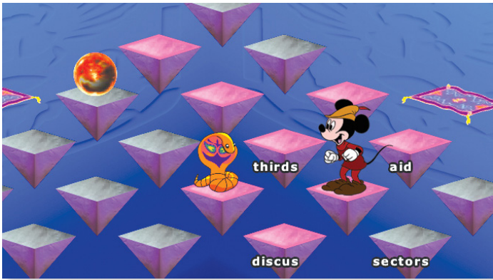
Mickey Mouse and the Pyramid of Peril