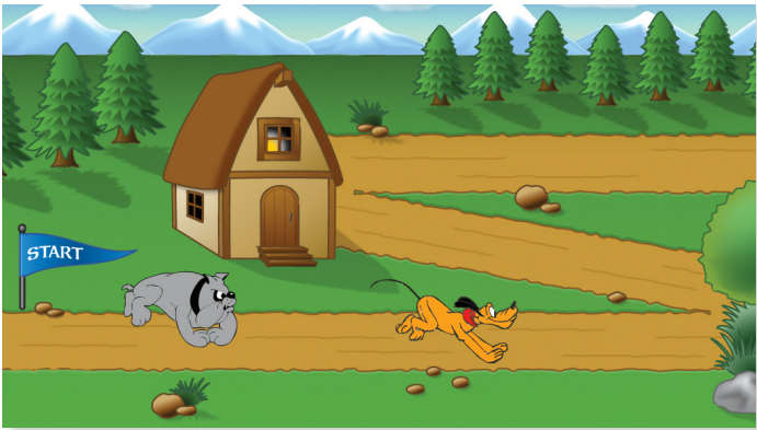
Run Pluto Run