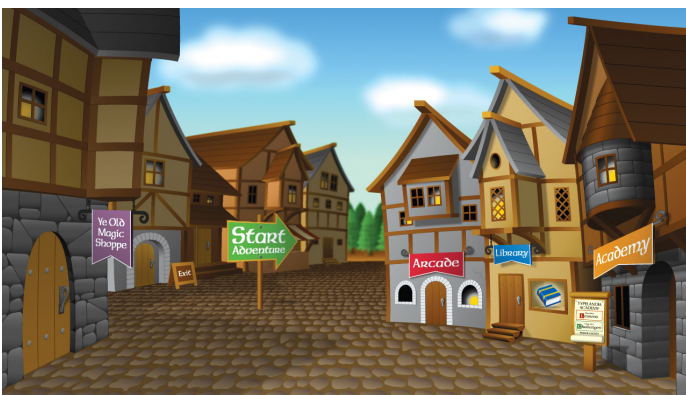
Students begin their Adventure in the Village in Typelandia.