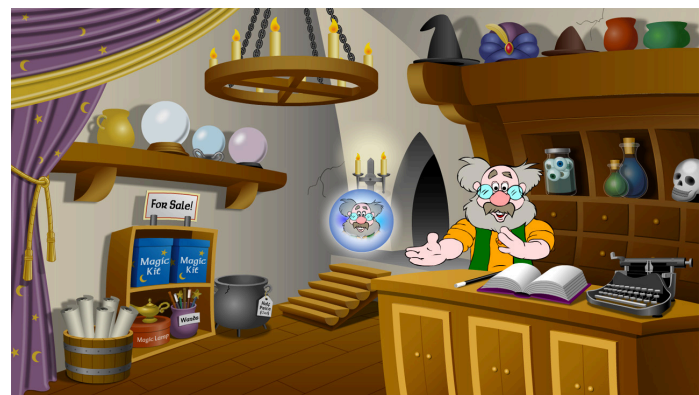
Visit Ye Old Magic Shoppe in the Village. The Shopkeeper joins students in a crystal ball on their journey through Typelandia to guide them.