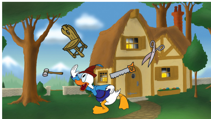
Oh no! Something is not quite right. Donald needs your help! Can you help him?