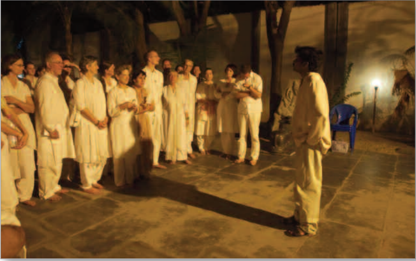
Swami and students gathered on the Dwarkamai slates during a special process.