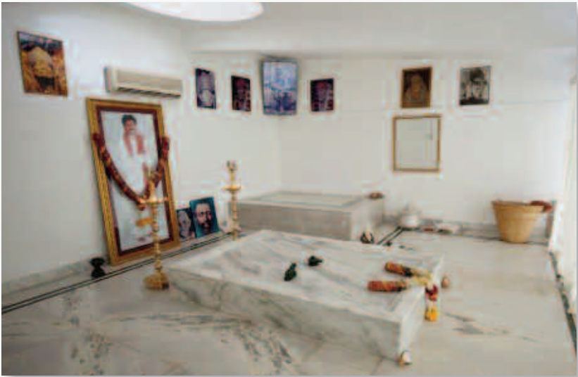
Swami's Mahasamadhi in the Dwarkamai