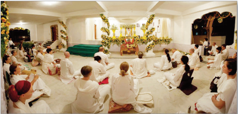
Students meditating in Swami's Mahasamadhi, March 29th, 2012.