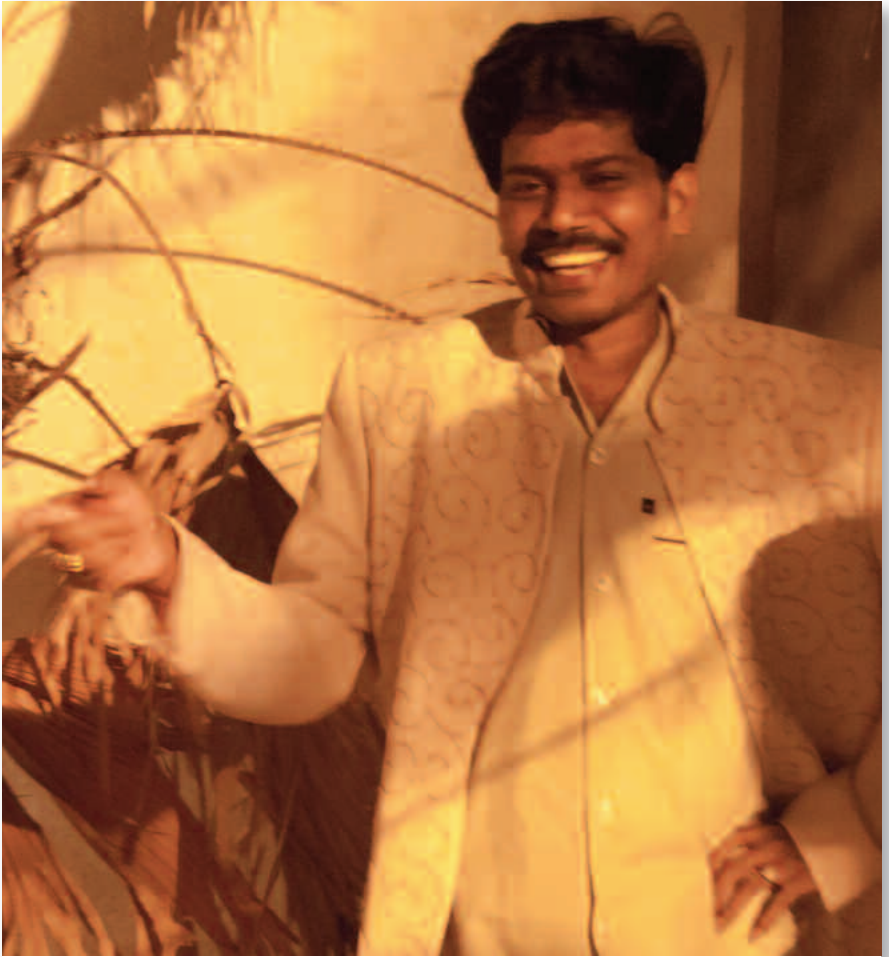
Swami showing green in the palm tree.