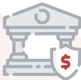
Link directly to bank accounts and upload bank statements