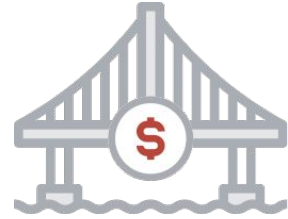
Hybridge® SBA Loan