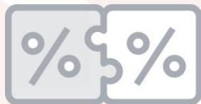
Lender & Financing program match tech