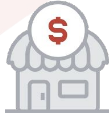
Small Business Loans