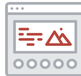
Co-branded landing page & Marketing Collateral