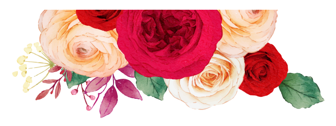
"Believe you can and you're halfway there." Theodore Roosevelt