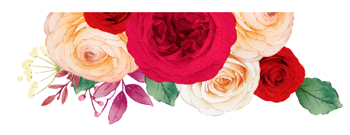
"Stay close to anything that makes you glad you are ALIVE." Hafez