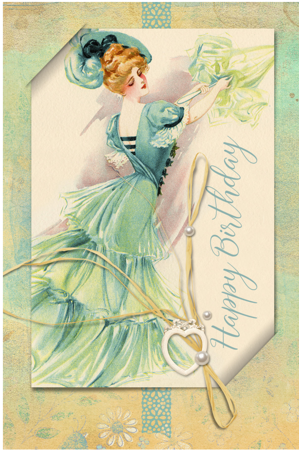
Card: Happy Birthday by Jen White Class: Digital Scrapbooking Mastery 2, Lesson 6 Kit: Summer Chills by Vero Font: Axellaria